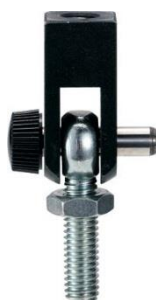
The supplied adapter