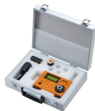
(Left) I-80 (Right) I-80 Product Standard Set